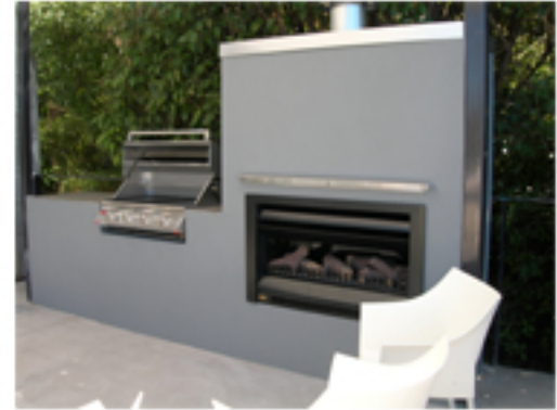
SEE WEBSITE FOR DETAILS

Made of light weight concrete surround Standard plaster finish, ready for painting No Foundations, Concrete pad needed – 1500x600x170 316 Stainless steel fascia and enameled firebox Powerful heat exchanger, LPG or NG – appliance will need commissioning by gas fitter Stainless Steel Flue system NO BUILDING PERMIT REQUIRED.