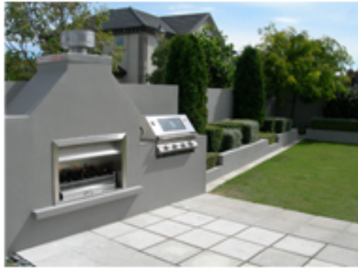
FIREPLACE IS BUILT ONSITE